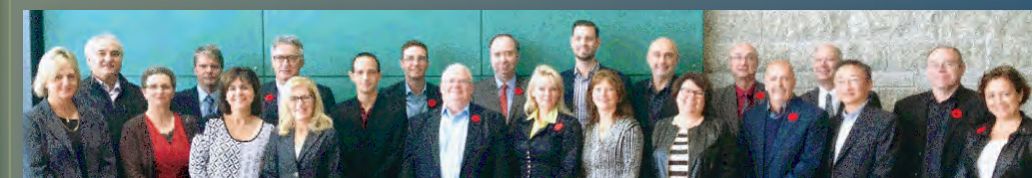
(Delegates at the Forum held at Ottawa City Hall.)

CCAF is pleased to have collaborated with Canada's municipal audit community to plan and deliver a national forum held on November 3-4, 2014. The Forum brought together Auditors General and heads of audit from 16 municipalities across Canada, in addition to the Auditor General for Local Government (AGLG), representing over 200 municipalities in BC.